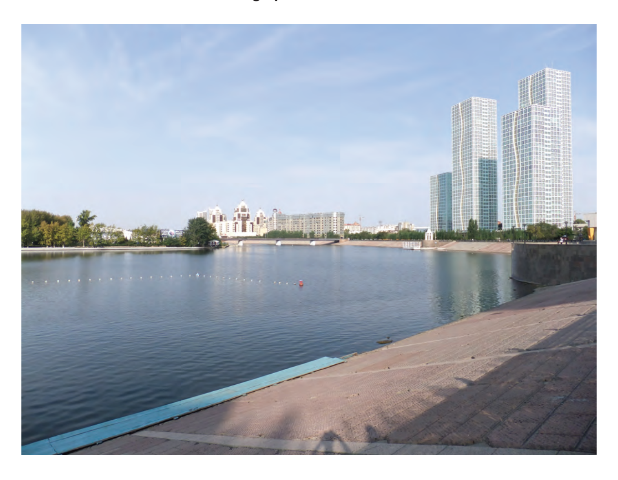
2 Photograph A for Question 3